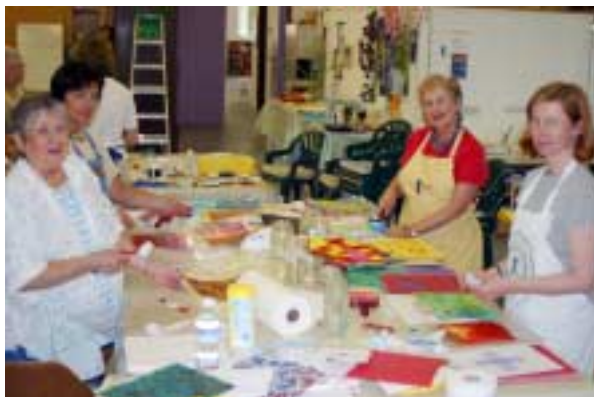
Printmaking and paper designs