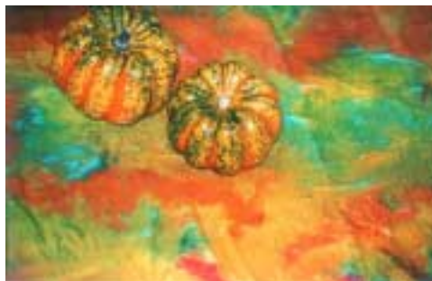
Squash on painted background

The nonrefundable deposit will hold your place. Deposit will apply to tuition. Please note: Students will be individually responsible for all associated costs and expenses such as: travel, accommodation, meals, etc. All payments may be made by personal check, money order, VISA, MasterCard, or American Express credit cards, payable to Gail Harker Creative Studies Center.