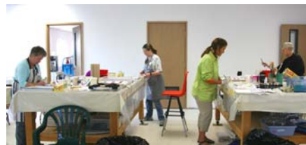
Popcorn Flowers, L1 Art & Design: Color Studies

Level 2 Certificate Course Starting 7 March 2009 Class Name: Lady Slipper