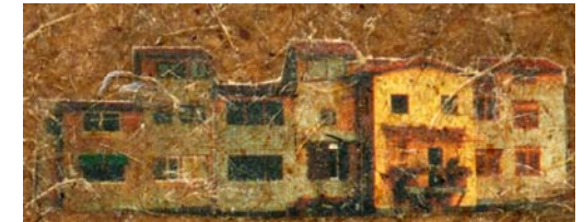
A lamination by Leah Kaufman

A $100 US deposit will hold your place in this course until 1 February 2010, at which time the full tuition/balance is due.