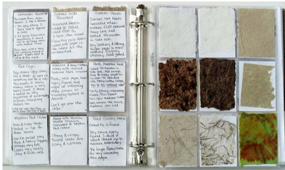
Lisa Harkins' ongoing sample documentation

Paper is the most basic necessity for so many creative art applications. Take a look in any art store, and the choices will boggle your mind, yet no store-bought paper can match the amazing textures, earthy colors, and special qualities you can achieve in your own home, using tools and materials that are easily available for little cost. This course is an introduction to the world of hand-made paper. Over two sessions, you will learn the specialized skills and techniques that will allow you to approach papermaking with creativity and confidence. This course also serves as a foundation for the Level 2 Certificate course.