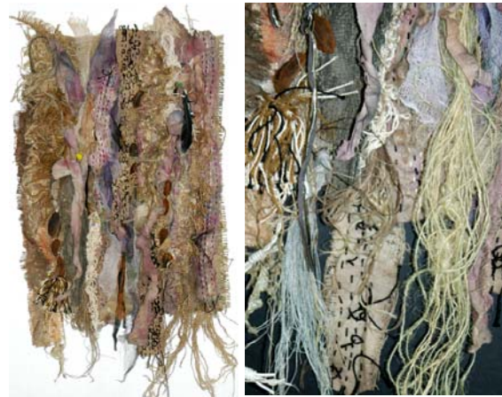
© Renae Phillips (right two pieces)