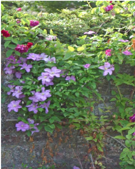
© 2006 Artwork: Helen Custer