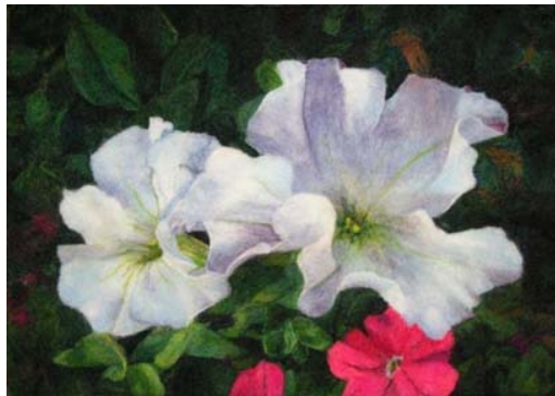
© Pat Spark, Linn County Courthouse Petunias