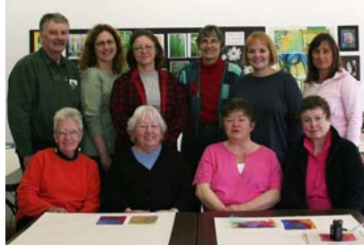
Foxgloves at work in the studio.