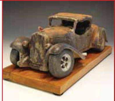
4. Dan Ishler