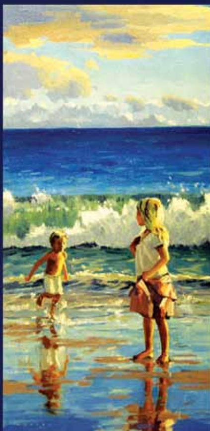
Painting by Ronaldo Macedo "Siblings"

For a complete listing of workshops please visit www.pacificnorthwestartschool.org