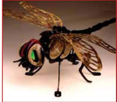
5. Brian Yates