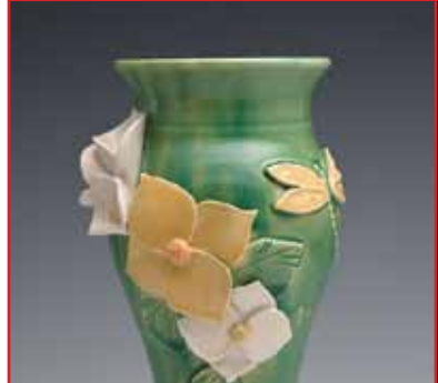
5. Lon & Julie Tosch