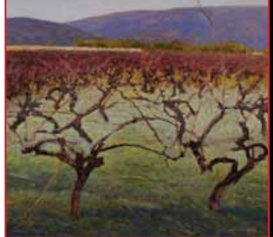
21. Kent Lovelace