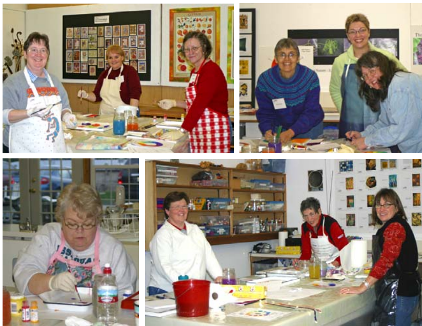
Pinks at work in the studio.