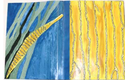
Top: Barb Bland Bottom: Evelyn Batchelor