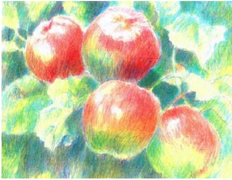
Apples (6 1/4" x 8 1/2"), from Basic Drawing Techniques by Richard Box, Search Press