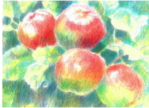
Apples (6 1/4" x 8 1/2"), from Basic Drawing Techniques by Richard Box, Search Press