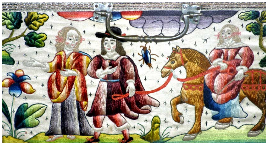
Above: Embroidered Casket housed at the Victoria and Albert Museum, London.