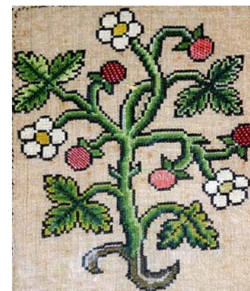
Strawberry Slip C. 1600

A $100 deposit will hold your place on this course until 14 August 2009, at which time the full tuition/balance is due.