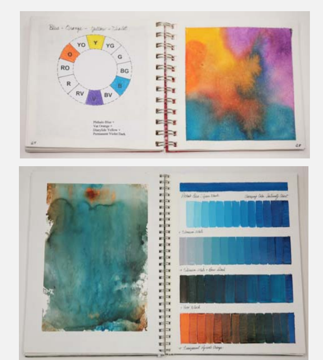
Two Reference Sketchbooks from the class