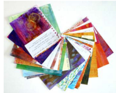
Artwork © Karen Williams

The number of sessions scheduled and the duration over which they are offered is a reflection of the breadth and depth of the content this course covers. Each class session is geared to the introduction of new material. The program assumes that each student will complete assigned work between sessions in order to stay abreast of the class. Those who successfully complete the program to the required standard will be awarded the Gail Harker Center for Creative Arts certificate.