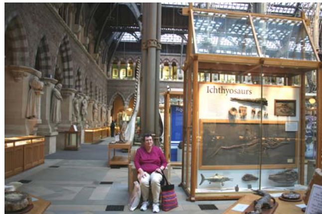
Oxford University Museum - June resting. The courtyard is lined with statues of eminent men of science: Aristotle, Bacon, Linnaeus and Darwin can all be found. Cloistered arcades line the perimeter of the courtyard supported by columns made from different British stones.