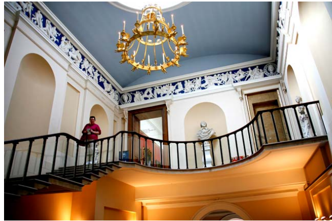
June at the Ashmolean Museum.

English Embroideries by Mary M. Brooks ISBN 1854441930 explores the Ashmolean Museum of Art and Archaeology's collection of 17th C. Embroideries. There are a profusion of detailed photographs of many styles of embroidery that include Raised Work and Metal Thread Embroidery. The text is very informative and portrays a diverse selection of subjects that were used for embroidery in this time period. There is a shop on their website that shows a list of their publications. The book is small and good value. Visit The Ashmolean Museum of Art and Archeology's Shop at http://www.ashmolean.org/shop/