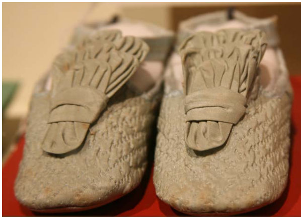
Quilted baby shoes English 18th Century at Pitt Rivers Museum

The Irish stone carvers O'Shea and Whelan created the gothic ornamentation. The naturalistic stone carvings and wrought iron work blend the Pre-Raphaelite with the scientific function of the building. We counted over 50 carved capitals.