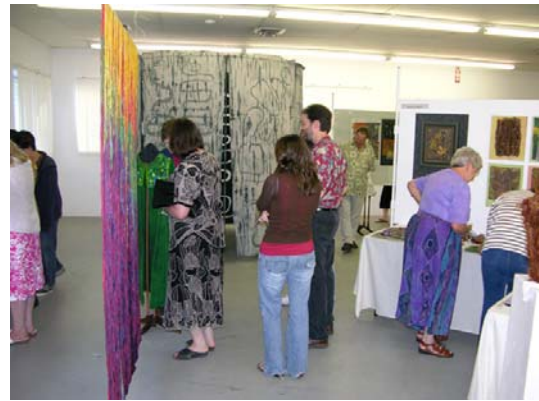
A few visitors enjoy the exhibition.