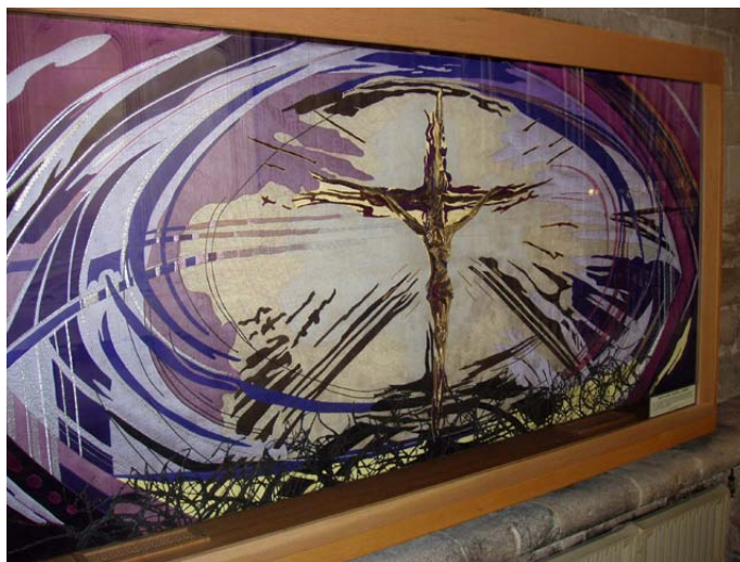
A close up of the Advent altar frontal.

Metal Thread Embroidery, Tools, Materials and Techniques by Jane Lemon is an outstanding classic book on the subject which has recently been republished by Batsford Publishers in 2002. Each section of the book is alphabetized and the entire book is published with over 200 colored photos and easy to understand illustrations.